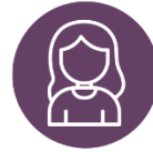
Staff Member or Volunteer