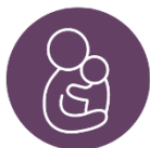
Parent or Guardian